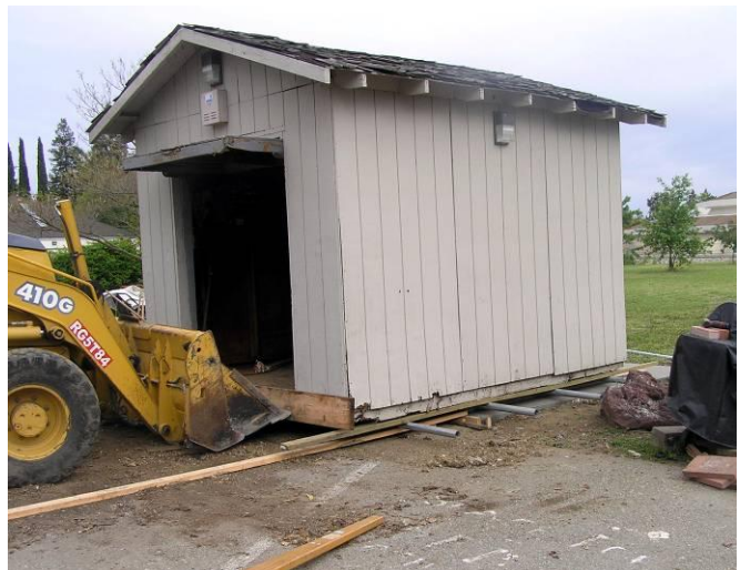
Now we bring in the heavy artillery.